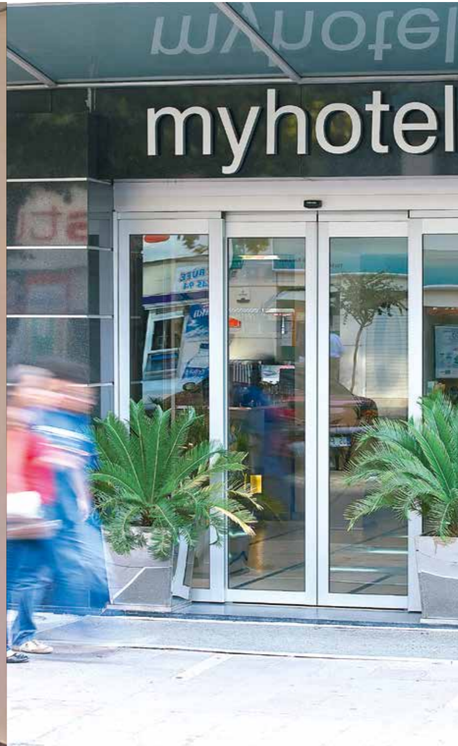
Bi-parting sliding door with framed leaves and reinforced frame. Hotel sector.