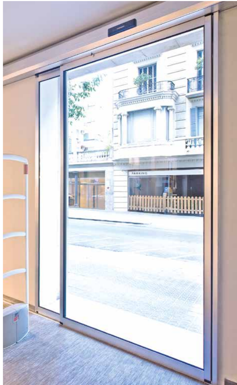
Single sliding door with framed leaf. Retail sector.