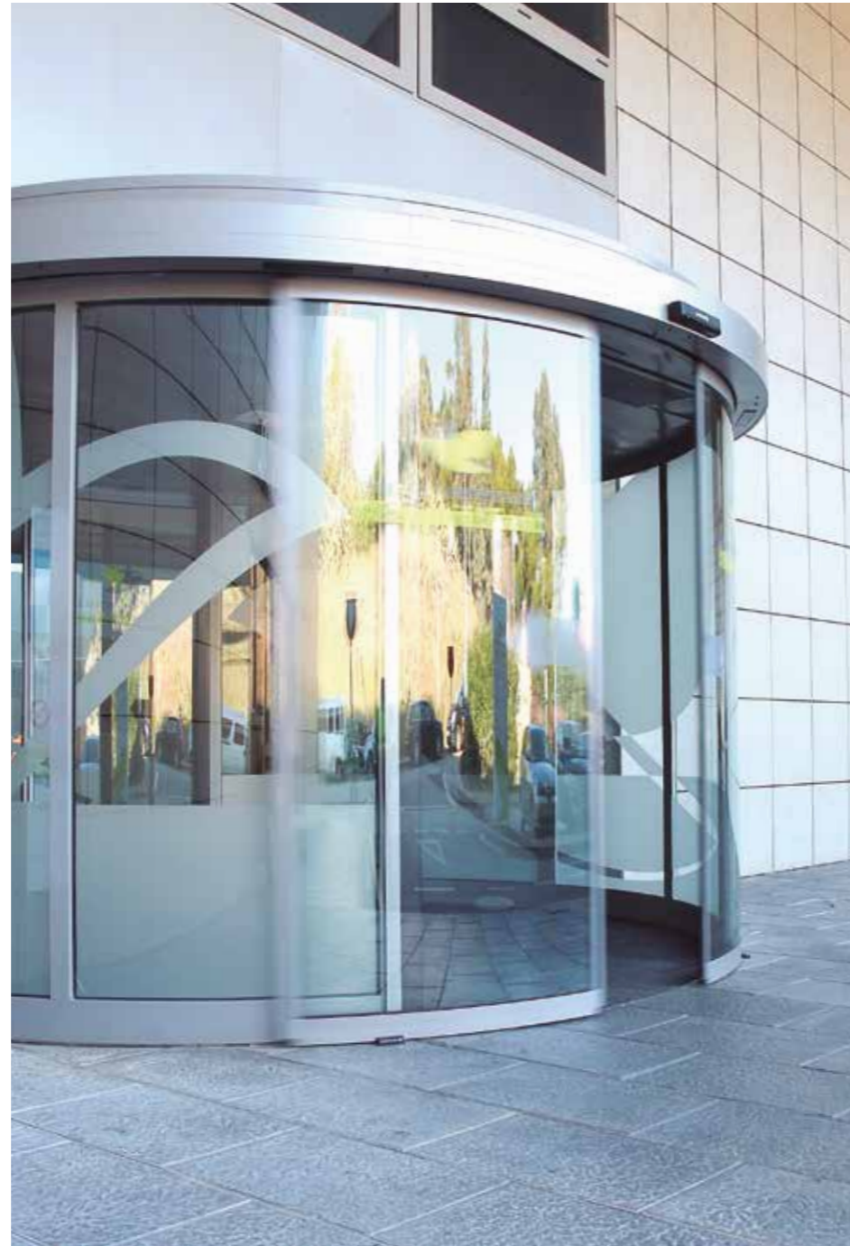
Circular automatic door. Hospital.

The door may be concave or convex and with different radius and degrees of curvature. The combination of two curved doors creates circular doors, ideal for entrances that are both exceptional and functional at the same time.