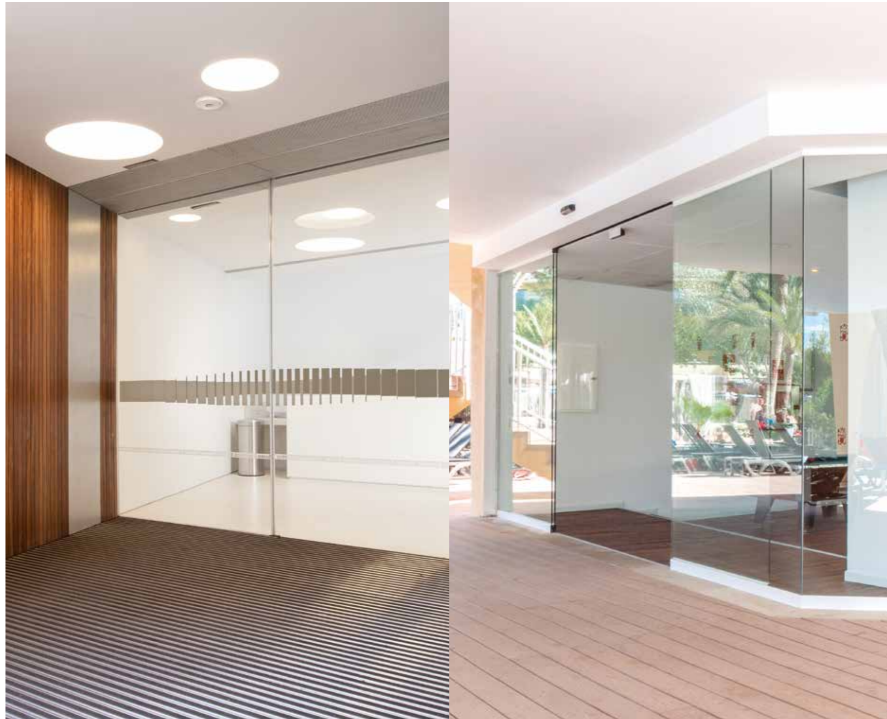
Single sliding door with total transparent leaves, option of hidden rail. Museum sector.