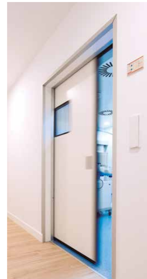
Hermetic sliding doors. Hospital operating theatres.

The whole door assembly is designed to guarantee hygiene: recessed vision panel, door handle, easy cleaning materials.