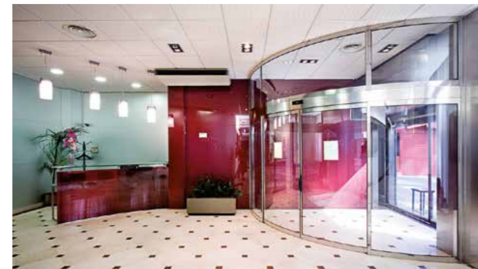
Circular automatic door. Library.