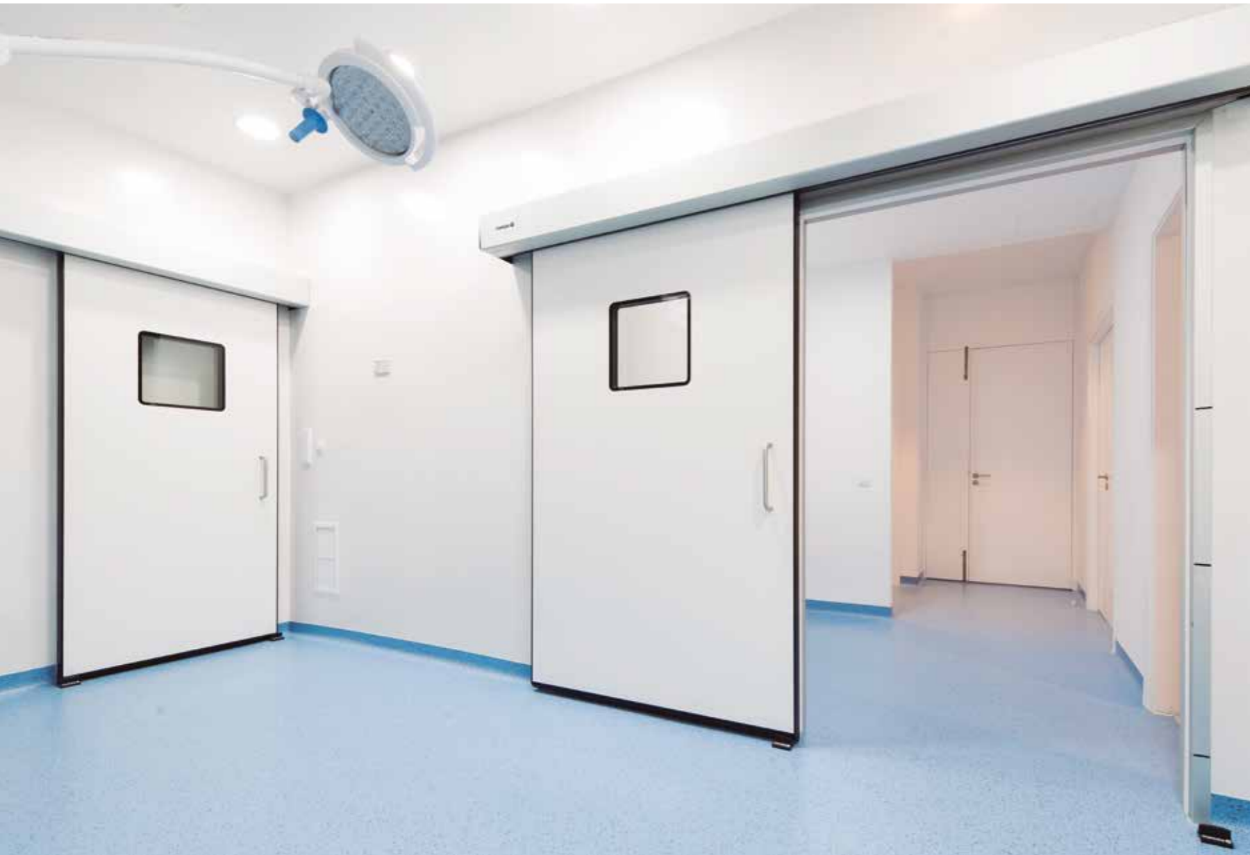
Hermetic sliding doors. Hospital operating theatres.

Manusa's hermetic doors unite the advantages of an automatic door with the seal and hygiene required in clean room environments.