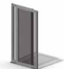
45 mm frame

Applicable to bi-parting and single automatic sliding doors.