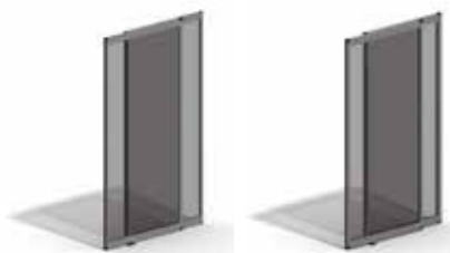
20 mm frame

Applicable to bi-parting, single sliding, telescopic, curved and semicircular automatic sliding doors.